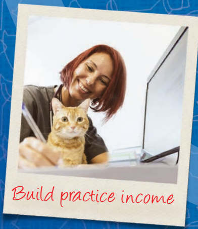
Build practice income