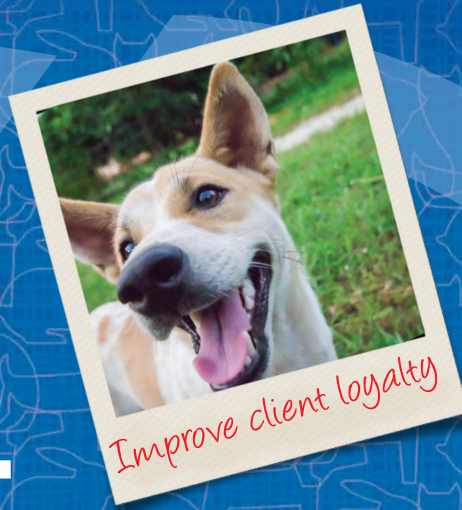
Improve client loyalty